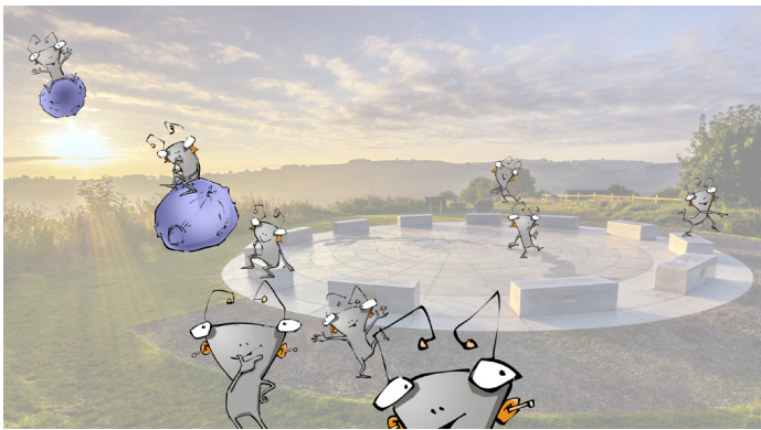
Trianglion - 9