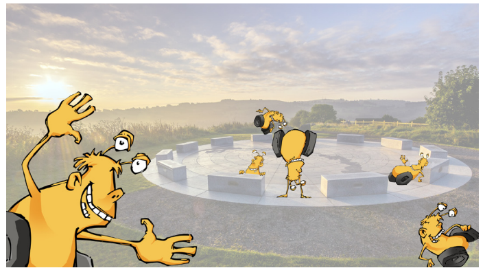
Wheelius - 6